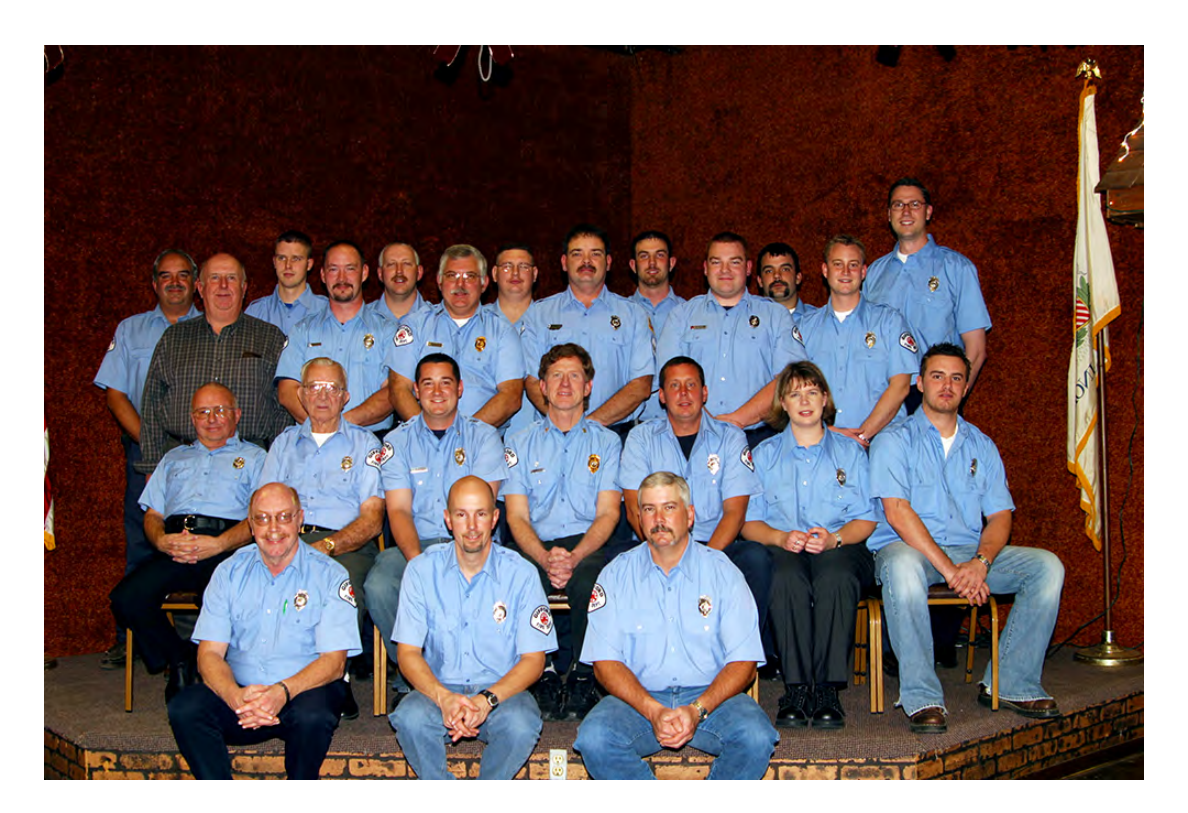
Here's a photo of me with the Gifford Volunteer Fire Department around 2004. Can you find me in the group?

The second time, I was climbing onto a pitched roof of a house that was engulfed in flames during winter. While directing a hose through a window, I imagined the very real possibility of slipping on the icy shingles. Happy to report that my boots held firm.