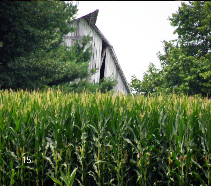
Cream of the Crop Photo Contest 2015 Winning Photos

The Unclaimed Property Program, known as I-Cash, is one of the state's oldest consumer protection programs, dating back to 1962. The State Treasurer's I-Cash program safeguards more than 14 million properties valued at approximately $2.1 billion. Under Illinois law, the Treasurer's Office is the custodian of unclaimed property, which includes lost bank accounts, insurance policy proceeds, forgotten safe deposit boxes, stocks, bonds, mutual funds, bill overpayments, and other recovered property. Our goal is to reunite Illinois families with their assets and family mementos. When unclaimed property is received, it is deposited into the Unclaimed Property Trust Fund, and later excess funds are transferred to the State Universities Retirement Systems (SURS) to help pay the state's pension obligations.